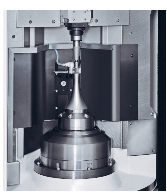
Perfect accessibility and user-friendliness

The Reishauer PrecisionDrive works in perfect harmony with all the NC units such that all procedures are running in parallel which eliminates secondary times. In this way, even at cycle times as short as 10 seconds, there is sufficient time for spinning off the oil while the part is still in the machine. Extra-wide grinding wheels together with multirib full profile rolls minimize the dressing time component per gear part.