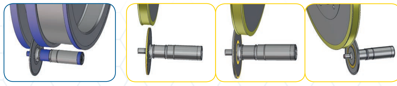
Machining Wheel 1: diameter (wheel width 200mm) Machining Wheel 2: different shoulders and diameters