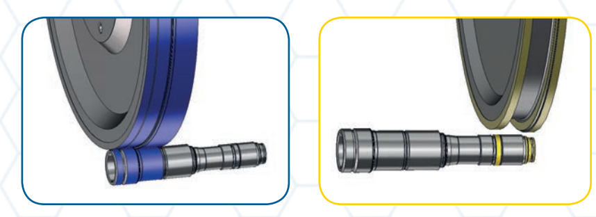
Machining Wheel 1 & 2: Diameter